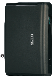
SAPEX The All-in-One Embedded IP-PBX Server

MATRIX TELECOM SOLUTIONS www.matrixtelecom.hu